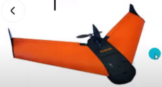
Fixed Wing Aircrafts