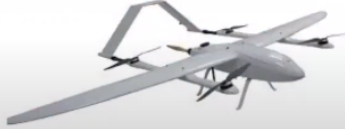
VTOL Hybrid Aircrafts